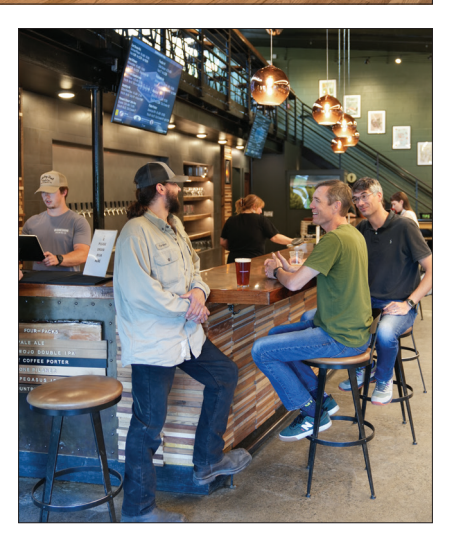
Top left: Treat Station, Hampton Inn, Wilkesboro, NC. Top center: Custom Wine Rack, Rooster's Wood Fired Kitchen, Charlotte, NC. Top right: Naples Barstools and a Custom Backlit Glass Bartop, The Peddler Restaurant, Boone, NC.

Center left: Sloan Queen Bed, Nicewander Farm & Vineyard, Bristol, VA.